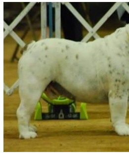
WHITE WITH TICK-