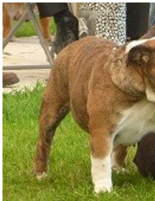
BRINDLE (can be fawn brindle)

Black, Black & Tan, Black/Tan/ White. Blue. Blue & any other colour. Dudley ie liver coloured nose, lips, eyelid, tongues and pads. Chocolate. AND any other colour not listed in the breed standard approved list.